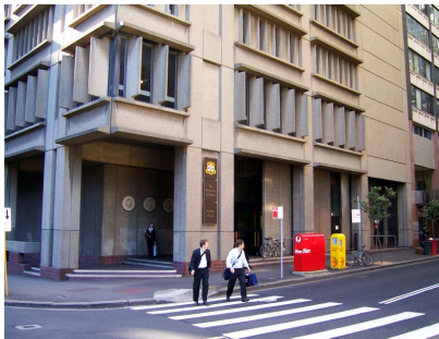
Sydney Law School

A: Elections are held during the Annual General Meeting, which at present, occurs in October. All ordinary members, and honorary members who are otherwise eligible for ordinary membership, may vote in and stand for election for any of the executive positions during the election.