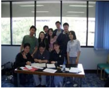
Ok Y Y _ ' D $ *

Favourite Quote: "If I have seen a little further it is by standing on the shoulders of giants"