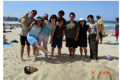
CLSS Beach Party

site also contains resources to help our members take the best advantage of opportunities: http://www.usydclss.com/